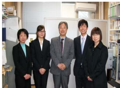
Graduation Picture with The Program Director

URL: http://www.gsscs.kumamoto-u.ac.jp/edu/zenki/gen/01/index.html