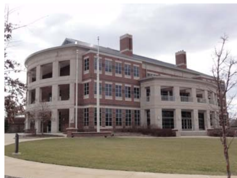
Alice Campbell Alumni Center

I 2 CNER held the first Satellite Symposium March 6th through the 7th on the campus of the University of Illinois at Urbana-Champaign. The events were hosted at a central location on the Illinois Campus, the Alice Campbell Alumni Center, one of the newest and most prestigious buildings in the entire university. The aim of these events was to celebrate the establishment of the Illinois Satellite Institute, and to formally kick-off the collaborative research projects between I 2 CNER’s Kyushu University and Satellite PIs.