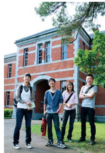
Students from China, Japan, and Lao