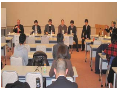
International Symposium on the Earthquake